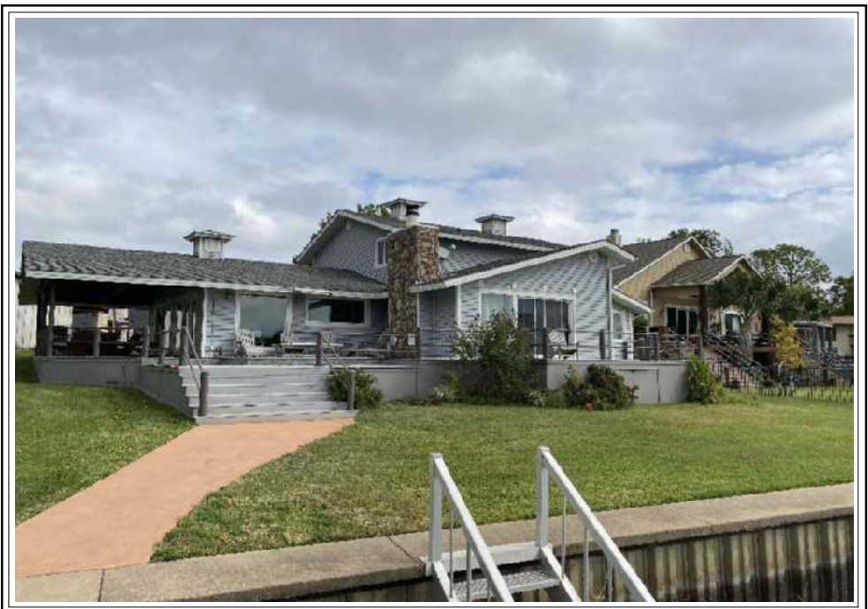
REAR VIEW OF SUBJECT PROPERTY

Appraised Date: November 4, 2022 Appraised Value: $