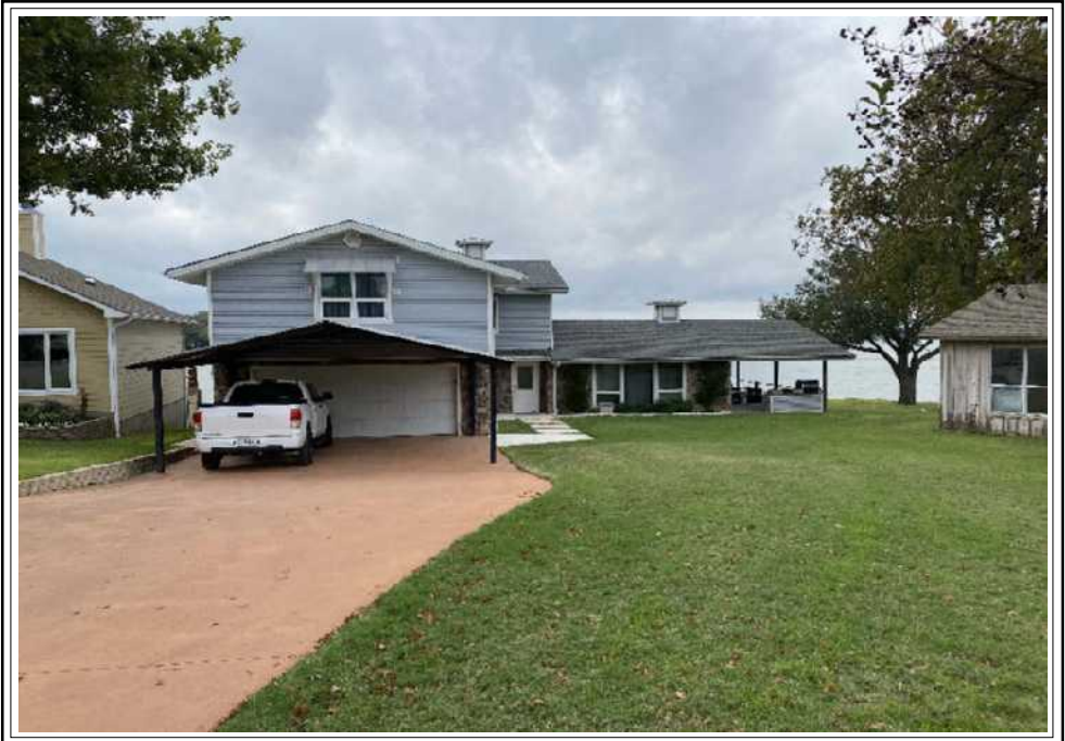
FRONT VIEW OF SUBJECT PROPERTY

Appraised Date: November 4, 2022 Appraised Value: $